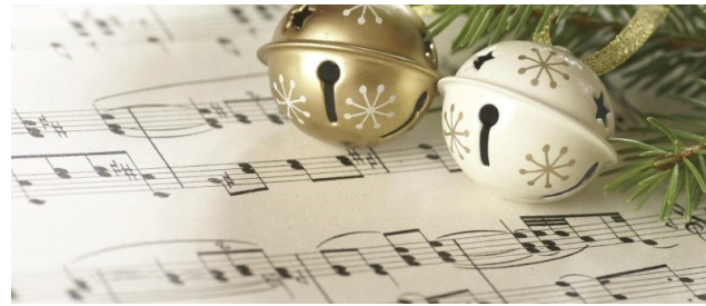
Student Winter Recital Sunday, December 17th 3:30 pm Spanaway Lutheran Church

May you and your family have a beautiful and blessed holiday season! And thank you in advance for your support!